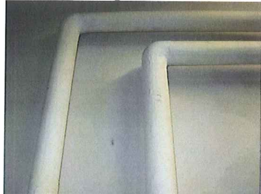
#4) Lineal Pipeline Insulation