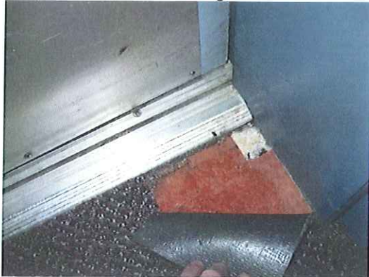
#3) Sheet Flooring Beneath Carpet