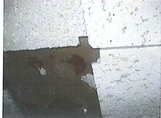
#2) 1' x 1' Ceiling Tile