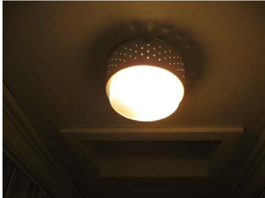
#1) Light Fixture Heat Shield